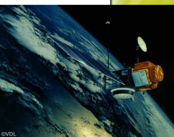
While Earth's magnetic field is low, solar storms could damage satellites, disrupting communications and research.

The main danger to humans and life on Earth will occur during the transition from one direction to the other. When the strength of our protective magnetic field is low, heavy solar winds could damage satellites. Earth's surface will see an increase in harmful radiation. This could lead to an increase in diseases such as cancer. However, because this decline will happen over centuries, scientists will have time to develop solutions to these problems. After the poles reverse, the magnetic field should quickly regain its strength and our protective shield will be restored.