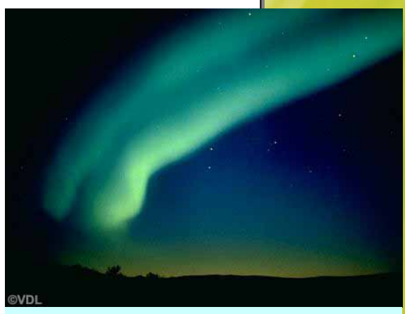
Interactions of solar winds and Earth's magnetic field produce the amazing light displays called auroras.

Colorful, glowing auroras are visible effects of Earth's protective magnetic field at work. Auroras are mainly visible