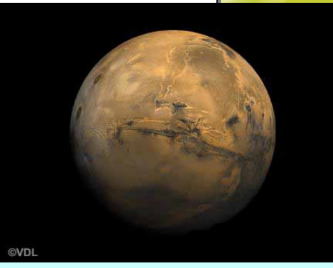
The lack of a magnetic field on Mars may have resulted in the planet's lack of a life-sustaining atmosphere.

Earth's magnetic field will go away for good when its iron core cools, just as Mars' did. Scientists have calculated the amount of