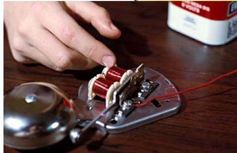
Electricity running through wire coils creates an electromagnet, like the kind found in doorbells, headphones, and other common devices.

The extension of Earth's magnetic field into space protects our planet from dangerous radiation and space "weather." Many people think of space as empty, but that is not the case. "Winds" of radiation and charged particles move through space and, if