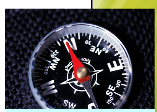
A compass needle points to Earth's magnetic north pole.

Earth's magnetic field results from the movement of liquid metals in the outer core of the planet. Deep in the center of Earth, liquid metal moves in circular convection currents. The circular movements of electrons in the metals create a magnetic field, much like