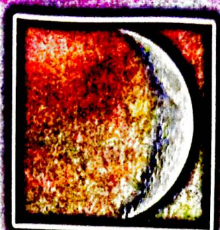
2 Waxing Crescent The portion of the moon you can see is waxing, or growing, into a crescent shape.