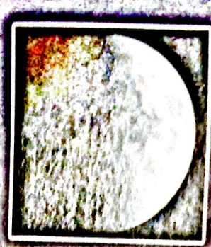
3 First Quarter You can see half of the sunlit side of the moon.