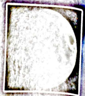
4 Waxing Gibbous The moon continues to wax. The visible shape of the moon is called gibbous.